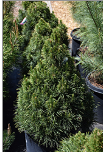
Green Penguin Scotch Pine