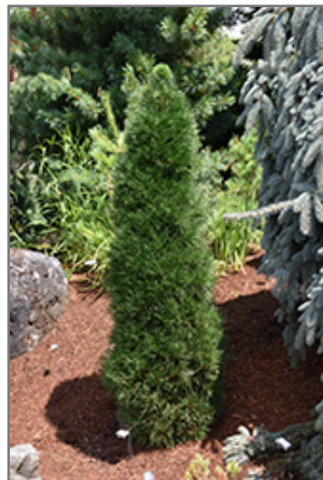
Green Penguin Scotch Pine