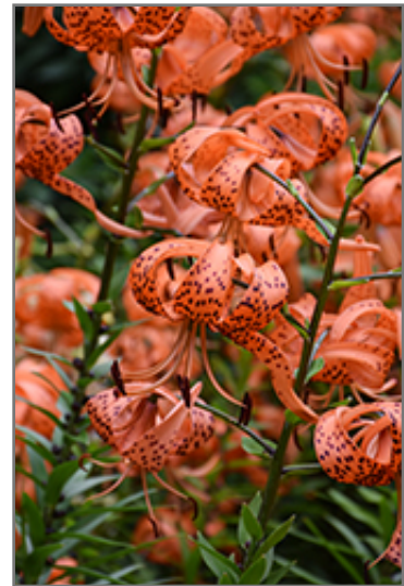
Tiger Lily flowers