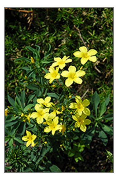
Dwarf Perennial Flax flowers

Dwarf Perennial Flax will grow to be about 12 inches tall at maturity, with a spread of 12 inches. When grown in masses or used as a bedding plant, individual plants should be spaced approximately 8 inches apart. It grows at a fast rate, and under ideal conditions can be expected to live for approximately 3 years. As an herbaceous perennial, this plant will usually die back to the crown each winter, and will regrow from the base each spring. Be careful not to disturb the crown in late winter when it may not be readily seen!