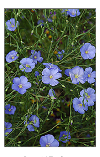
Perennial Flax flowers

Perennial Flax will grow to be about 24 inches tall at maturity, with a spread of 12 inches. When grown in masses or used as a bedding plant, individual plants should be spaced approximately 8 inches apart. It tends to be leggy, with a typical clearance of 1 foot from the ground, and should be underplanted with lower-growing perennials. It grows at a fast rate, and under ideal conditions can be expected to live for approximately 3 years. As an herbaceous perennial, this plant will usually die back to the crown each winter, and will regrow from the base each spring. Be careful not to disturb the crown in late winter when it may not be readily seen!