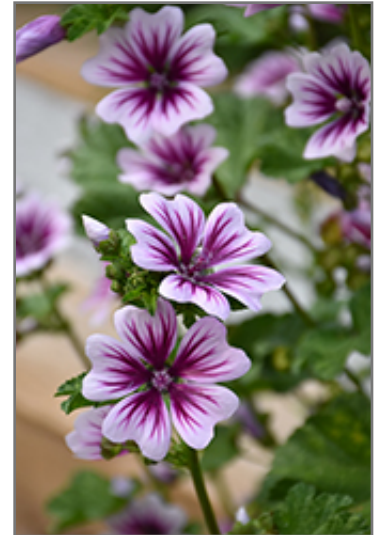
Zebrina Mallow flowers