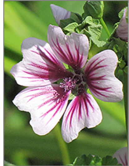
Zebrina Mallow flowers