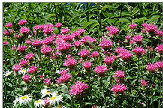
Marshall's Delight Beebalm flowers