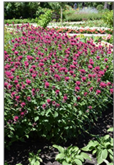
Raspberry Wine Beebalm in bloom