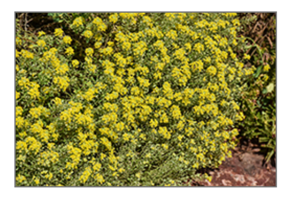
Mountain Alyssum flowers