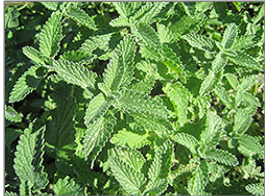
Walker's Low Catmint foliage

Walker's Low Catmint is a fine choice for the garden, but it is also a good selection for planting in outdoor pots and containers. It is often used as a 'filler' in the 'spiller-thriller-filler' container combination, providing a mass of flowers against which the thriller plants stand out. Note that when growing plants in outdoor containers and baskets, they may require more frequent waterings than they would in the yard or garden. Be aware that in our climate, most plants cannot be expected to survive the winter if left in containers outdoors, and this plant is no exception. Contact our experts for more information on how to protect it over the winter months.