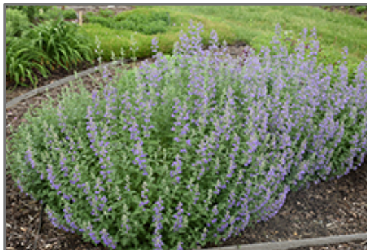
Walker's Low Catmint in bloom