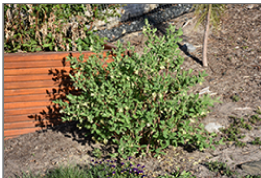
Boreal Blizzard Honeyberry in bloom