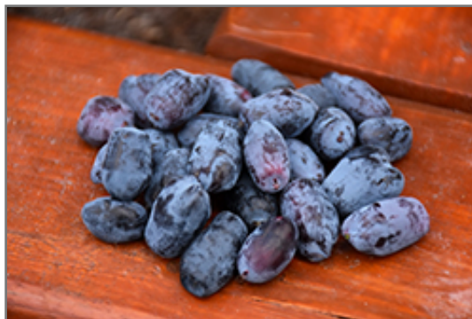
Boreal Blizzard Honeyberry fruit

Boreal Blizzard Honeyberry features subtle chartreuse flowers along the branches in early spring. It has green deciduous foliage. The narrow leaves do not develop any appreciable fall colour. It features an abundance of magnificent navy blue berries with powder blue overtones from early to mid summer.