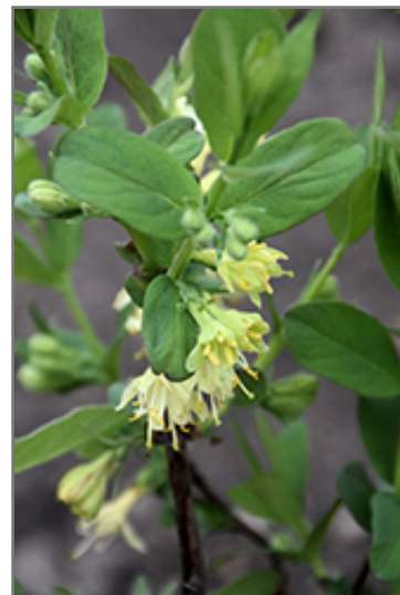
Boreal Blizzard Honeyberry flowers

This shrub is quite ornamental as well as edible, and is as much at home in a landscape or flower garden as it is in a designated edibles garden. It does best in full sun to partial shade. It prefers dry to average moisture levels with very well-drained soil, and will often die in standing water. It is not particular as to soil type or pH. It is highly tolerant of urban pollution and will even thrive in inner city environments. This is a selected variety of a species not originally from North America.