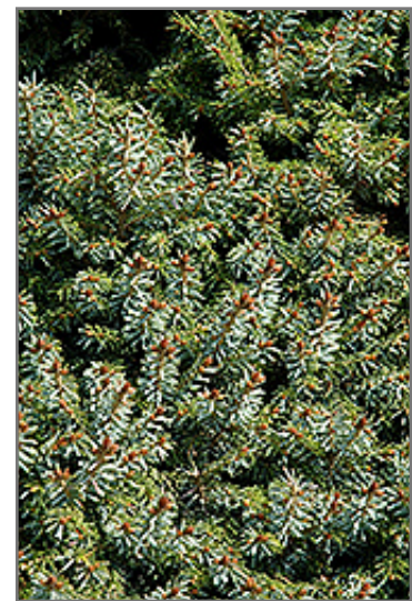
Dwarf Serbian Spruce foliage