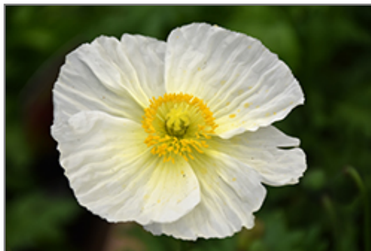
Spring Fever White Poppy flowers