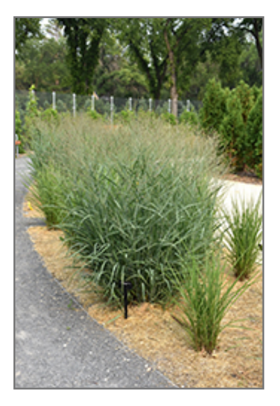
Heavy Metal Blue Switch Grass