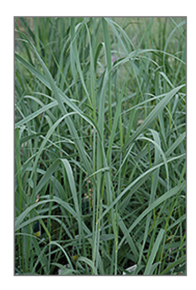
Heavy Metal Blue Switch Grass foliage