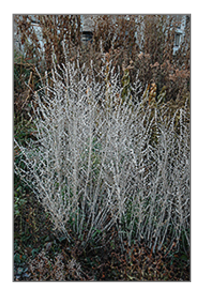
Russian Sage in winter

This plant should only be grown in full sunlight. It prefers dry to average moisture levels with very well-drained soil, and will often die in standing water. It is considered to be drought-tolerant, and thus makes an ideal choice for a low-water garden or xeriscape application. It is not particular as to soil type, but has a definite preference for alkaline soils. It is highly tolerant of urban pollution and will even thrive in inner city environments. This species is not originally from North America.