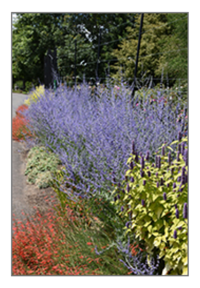
Russian Sage in bloom