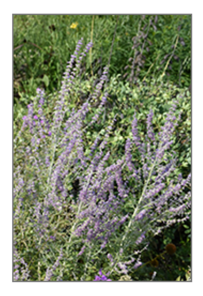
Russian Sage flowers