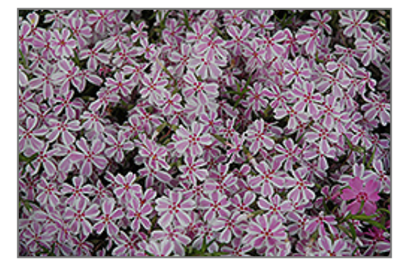
Candy Stripe Moss Phlox flowers

Candy Stripe Moss Phlox is smothered in stunning pink star-shaped flowers with crimson eyes and white stripes at the ends of the stems from early to late spring. Its tiny needle-like leaves remain forest green in colour throughout the year.