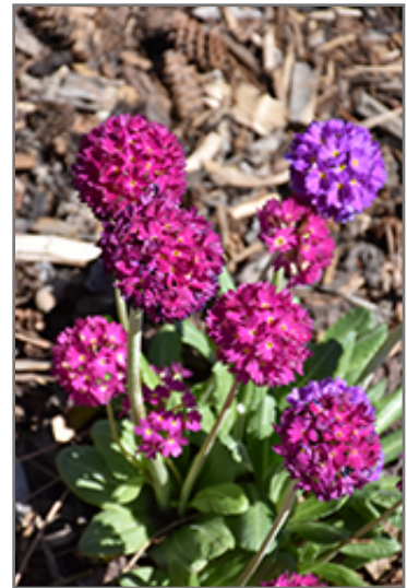
Drumstick Primrose flowers