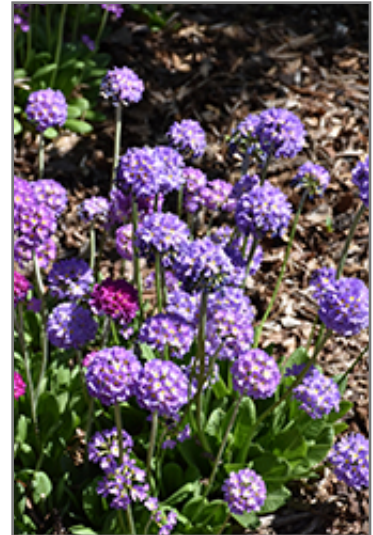
Drumstick Primrose in bloom