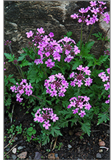
Drumstick Primrose in bloom

This plant does best in partial shade to shade. It does best in average to evenly moist conditions, but will not tolerate standing water. It is not particular as to soil type or pH. It is somewhat tolerant of urban pollution, and will benefit from being planted in a relatively sheltered location. Consider covering it with a thick layer of mulch in winter to protect it in exposed locations or colder microclimates. This species is not originally from North America.