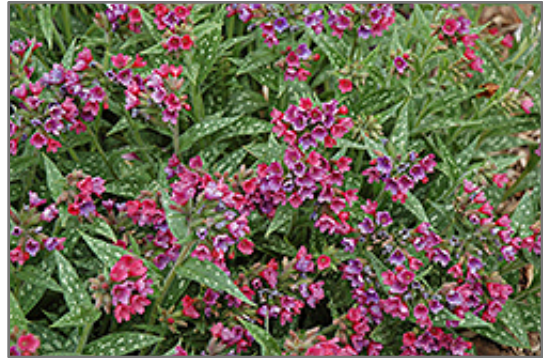
Raspberry Splash Lungwort flowers