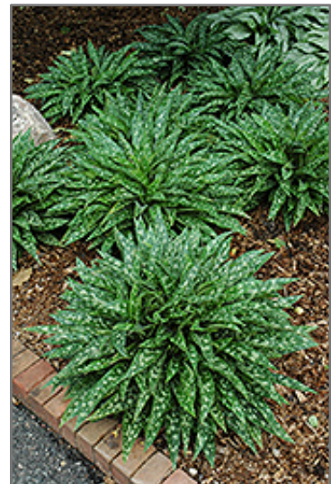
Raspberry Splash Lungwort