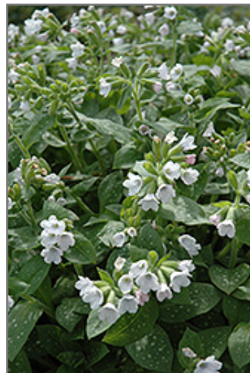
Sissinghurst White Lungwort flowers