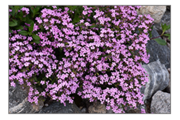
Rock Soapwort in bloom