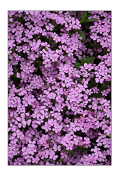
Rock Soapwort flowers