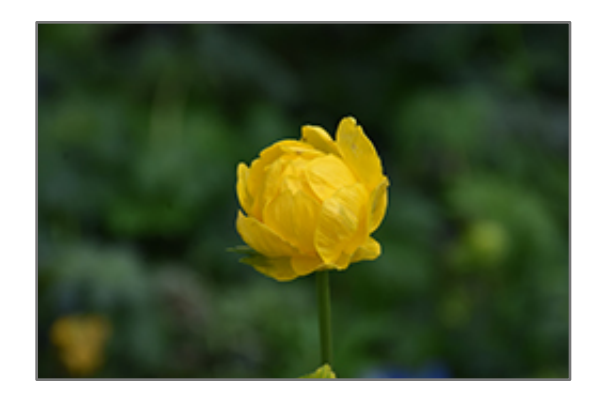
Lemon Queen Globeflower flowers