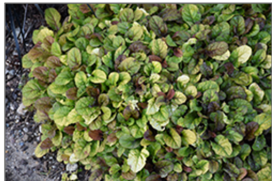
Feathered Friends Parrot Paradise Bugleweed