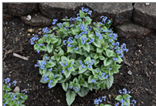
Sterling Silver Bugloss in bloom