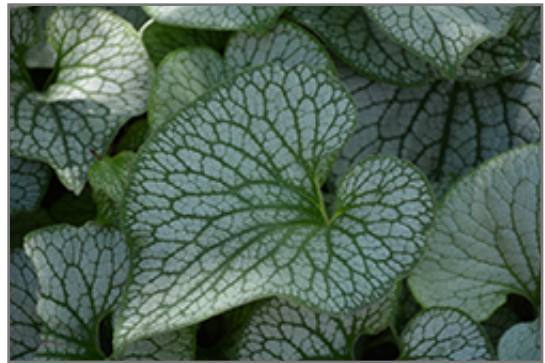
Sterling Silver Bugloss foliage

Sterling Silver Bugloss will grow to be about 12 inches tall at maturity, with a spread of 24 inches. When grown in masses or used as a bedding plant, individual plants should be spaced approximately 20 inches apart. It grows at a medium rate, and under ideal conditions can be expected to live for approximately 10 years. As an herbaceous perennial, this plant will usually die back to the crown each winter, and will regrow from the base each spring. Be careful not to disturb the crown in late winter when it may not be readily seen!