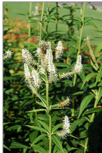
Culver's Root flowers