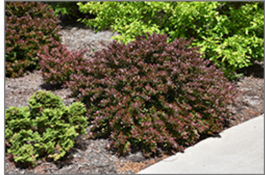
Concorde Japanese Barberry

Concorde Japanese Barberry is recommended for the following landscape applications;