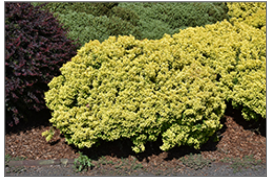
Golden Nugget Japanese Barberry