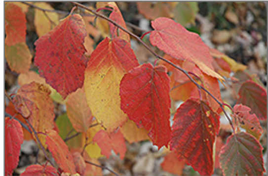
Beaked Hazelnut in fall

Beaked Hazelnut has dark green deciduous foliage on a plant with an upright spreading habit of growth. The serrated pointy leaves turn yellow in fall. It produces brown nuts in mid fall.