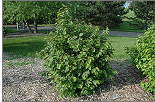
Beaked Hazelnut

This plant is typically grown in a designated edibles garden. It performs well in both full sun and full shade. It is very adaptable to both dry and moist locations, and should do just fine under average home landscape conditions. It is considered to be drought-tolerant, and thus makes an ideal choice for xeriscaping or the moisture-conserving landscape. It is not particular as to soil type or pH. It is highly tolerant of urban pollution and will even thrive in inner city environments. This species is native to parts of North America.