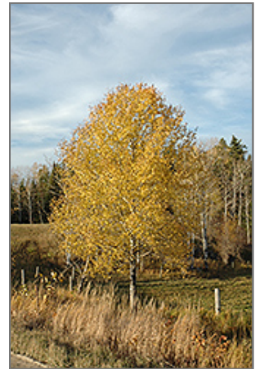
Trembling Aspen in fall

This tree should only be grown in full sunlight. It is an amazingly adaptable plant, tolerating both dry conditions and even some standing water. It is considered to be drought-tolerant, and thus makes an ideal choice for xeriscaping or the moisture-conserving landscape. It is not particular as to soil type or pH. It is quite intolerant of urban pollution, therefore inner city or urban streetside plantings are best avoided. This species is native to parts of North America.