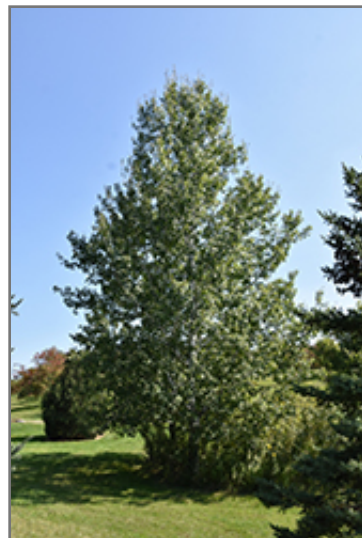
Trembling Aspen