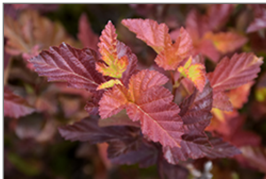
Center Glow Ninebark foliage

Center Glow Ninebark is recommended for the following landscape applications;