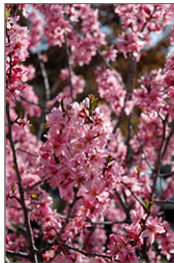
Muckle Plum (tree form) flowers