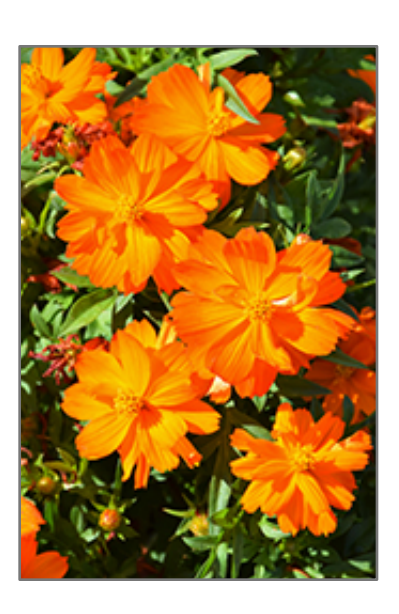
Mandarin Cosmos flowers