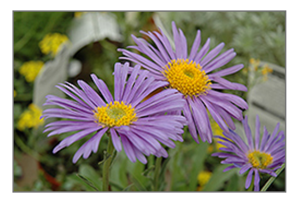
Goliath Alpine Aster flowers

A wonderful spring blooming addition to garden beds, borders or patio containers; low growing, mounded green foliage produces stems featuring lilac daisy flowers with yellow eyes; a drought tolerant variety requiring little to no maintenance