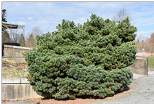
Blue Shag White Pine

Blue Shag White Pine is recommended for the following landscape applications;