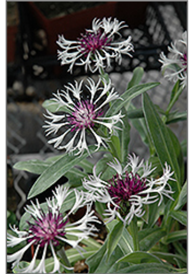
Amethyst In Snow Cornflower flowers

Amethyst In Snow Cornflower is recommended for the following landscape applications;