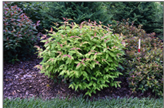
Kodiak Fresh Diervilla