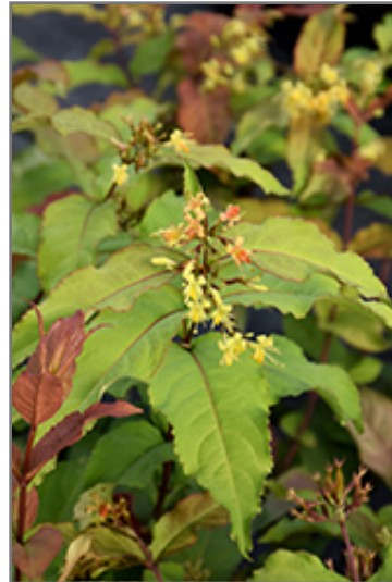
Kodiak Fresh Diervilla flowers