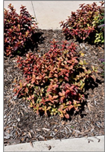
Midnight Sun Reblooming Weigela

This plant is not reliably hardy in our region, and certain restrictions may apply; contact the store for more information.