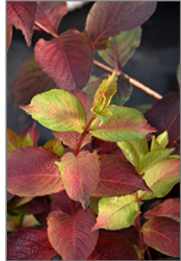
Midnight Sun Reblooming Weigela foliage