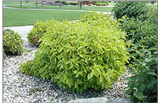
Prairie Fire Dogwood