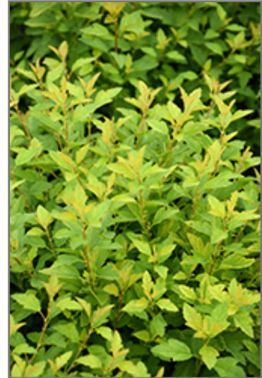
Raspberry Lemonade Ninebark foliage

Raspberry Lemonade Ninebark is recommended for the following landscape applications;