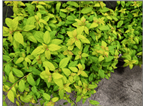
Little Spark Spirea foliage