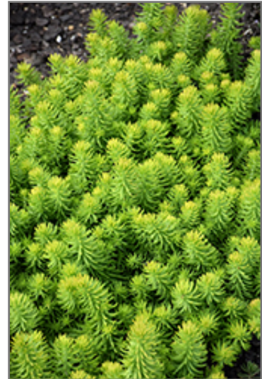
Prima Angelina Stonecrop