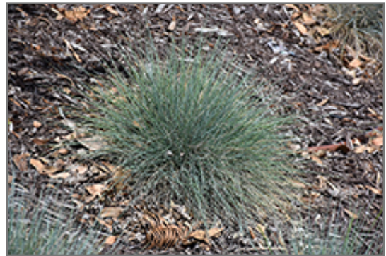
Boulder Blue Fescue