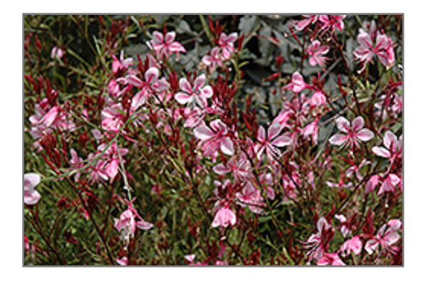
Butterfly Gaura flowers