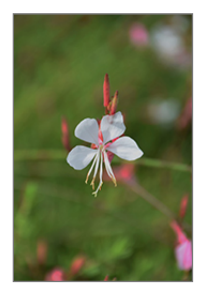
Butterfly Gaura flowers