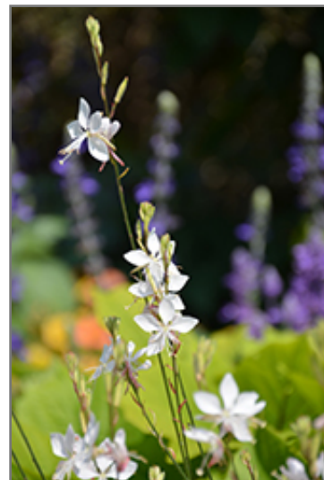
Stratosphere White Gaura flowers

This is a relatively low maintenance plant, and is best cleaned up in early spring before it resumes active growth for the season. It is a good choice for attracting butterflies to your yard, but is not particularly attractive to deer who tend to leave it alone in favor of tastier treats. It has no significant negative characteristics.