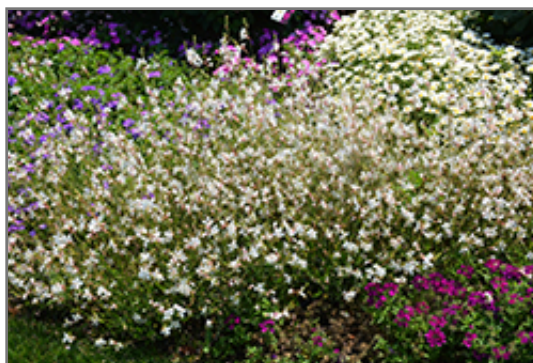
Stratosphere White Gaura in bloom