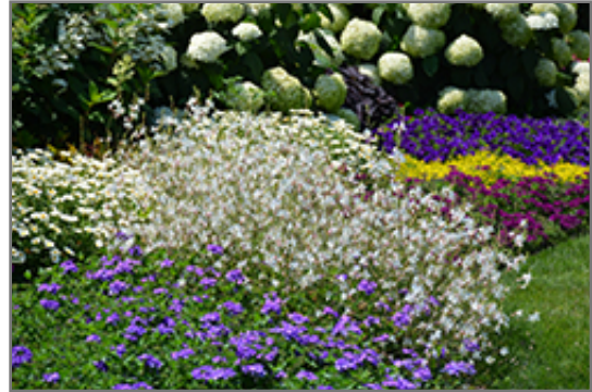
Stratosphere White Gaura in bloom

Stratosphere White Gaura will grow to be about 12 inches tall at maturity extending to 18 inches tall with the flowers, with a spread of 12 inches. When grown in masses or used as a bedding plant, individual plants should be spaced approximately 10 inches apart. Its foliage tends to remain dense right to the ground, not requiring facer plants in front. Although it's not a true annual, this fast-growing plant can be expected to behave as an annual in our climate if left outdoors over the winter, usually needing replacement the following year. As such, gardeners should take into consideration that it will perform differently than it would in its native habitat.