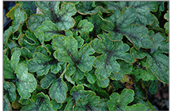
Dayglow Pink Foamy Bells foliage