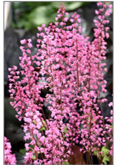
Dayglow Pink Foamy Bells flowers

* This is a 'special order' plant - contact store for details