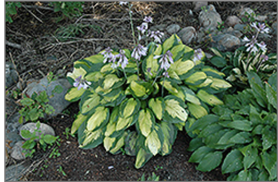
Captain Kirk Hosta in bloom

Captain Kirk Hosta will grow to be about 20 inches tall at maturity extending to 32 inches tall with the flowers, with a spread of 30 inches. When grown in masses or used as a bedding plant, individual plants should be spaced approximately 26 inches apart. Its foliage tends to remain dense right to the ground, not requiring facer plants in front. It grows at a medium rate, and under ideal conditions can be expected to live for approximately 10 years. As an herbaceous perennial, this plant will usually die back to the crown each winter, and will regrow from the base each spring. Be careful not to disturb the crown in late winter when it may not be readily seen!