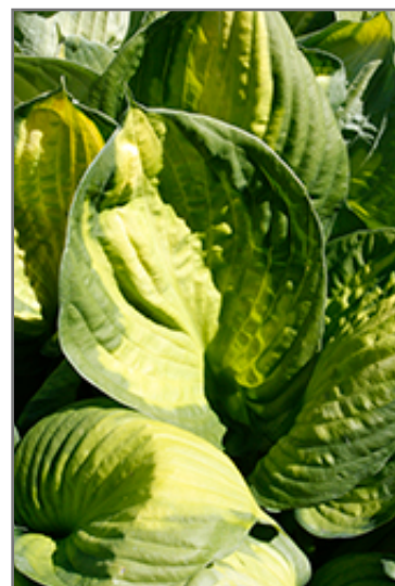
Captain Kirk Hosta foliage