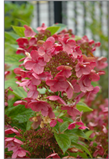
Quick Fire Hydrangea flowers (faded)

This shrub performs well in both full sun and full shade. It prefers to grow in average to moist conditions, and shouldn't be allowed to dry out. It is not particular as to soil type or pH. It is highly tolerant of urban pollution and will even thrive in inner city environments. Consider applying a thick mulch around the root zone in winter to protect it in exposed locations or colder microclimates. This is a selected variety of a species not originally from North America.