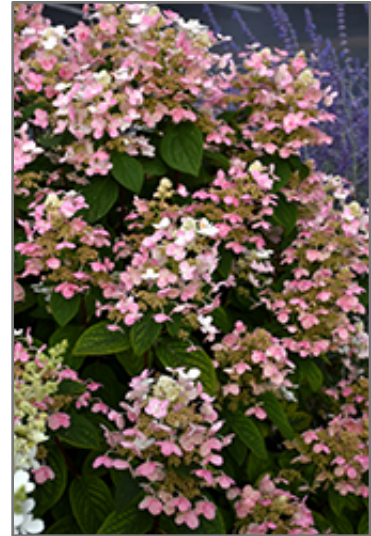
Quick Fire Hydrangea flowers