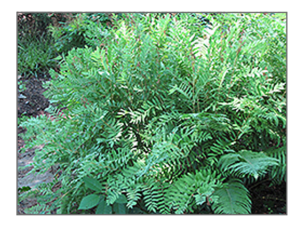
Royal Fern