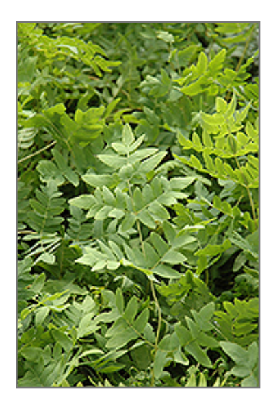
Royal Fern foliage