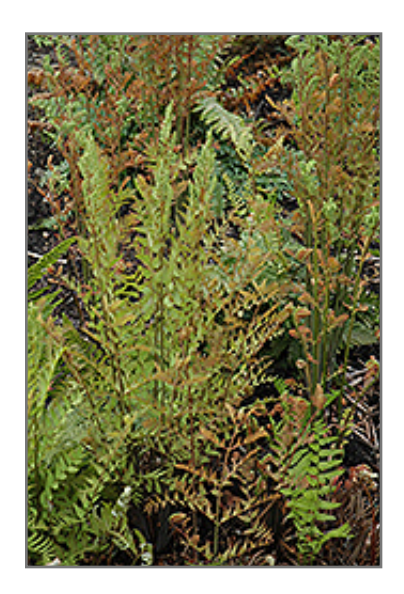
Royal Fern in spring

This plant performs well in both full sun and full shade. It prefers to grow in moist to wet soil, and will even tolerate some standing water. It is not particular as to soil type or pH. It is somewhat tolerant of urban pollution. Consider applying a thick mulch around the root zone over the growing season to conserve soil moisture. This species is not originally from North America. It can be propagated by division.