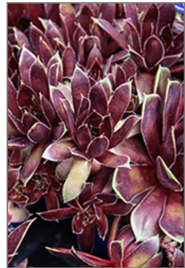
Colorockz Coconut Crystal Hens And Chicks