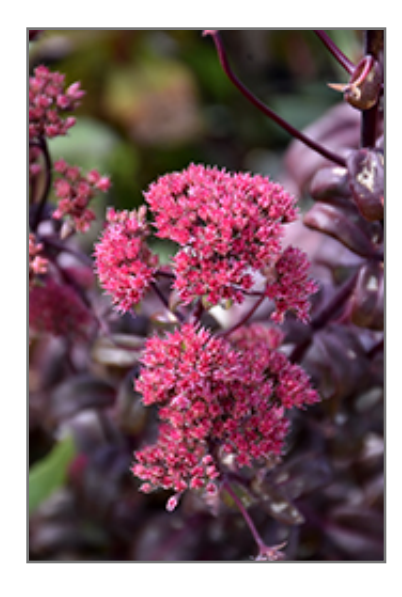
Purple Emperor Stonecrop flowers

Purple Emperor Stonecrop is a dense herbaceous perennial with an upright spreading habit of growth. Its relatively coarse texture can be used to stand it apart from other garden plants with finer foliage.