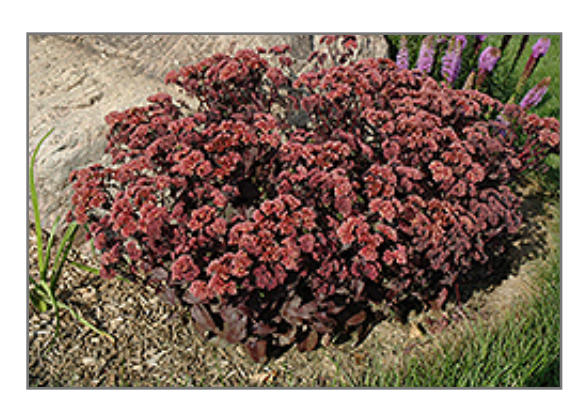
Purple Emperor Stonecrop in bloom