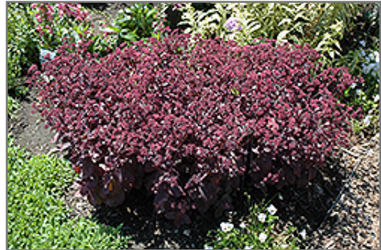
Xenox Stonecrop in bloom