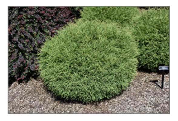
Mr. Bowling Ball Arborvitae

This tiny shrub just demands to be loved by all gardeners, with very unusual threadlike sage-green foliage and an extremely dwarf, compact form that requires no pruning to maintain its perfectly rounded shape; ideal for rock gardens and detail use